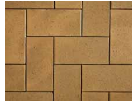
Commercial Terracotta W E S