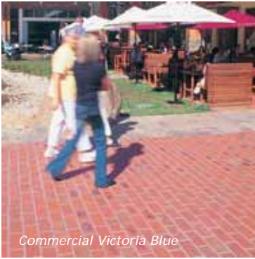
Commercial Victoria Blue

Austral Bricks' Commercial 65 Series are specially designed for high-traffic commercial applications. Their extra depth and patented keyed base work together to accommodate high axle loads and resist turning and braking forces. With their excellent slip resistance and high durability levels, Commercial 65 Series is also the answer for footpaths, malls and shopping precincts.