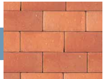
Old Brunswick Red V E S

Our Old Brunswick brick paver is an original sized paving brick. The hardwearing properties of fired clay combined with the beautiful blended red brick colours have graced the paths of some of Melbourne's most famous community and residential buildings. Today, renovators and new homebuilders alike, often look to real brick pavers to capture that enduring classic pavement or driveway.