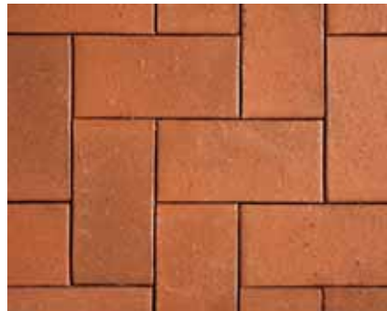
Commercial Red W E S