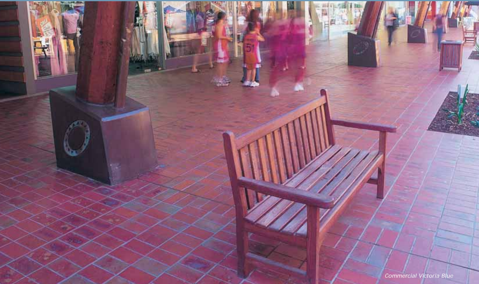
Commercial Victoria Blue